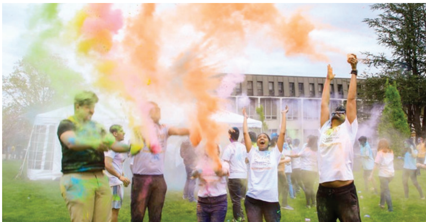
Let the colors of the Holi Festival spread the message of peace and happiness.

Last year, since it was the first time the festival was being celebrated on campus, the executive board was not sure