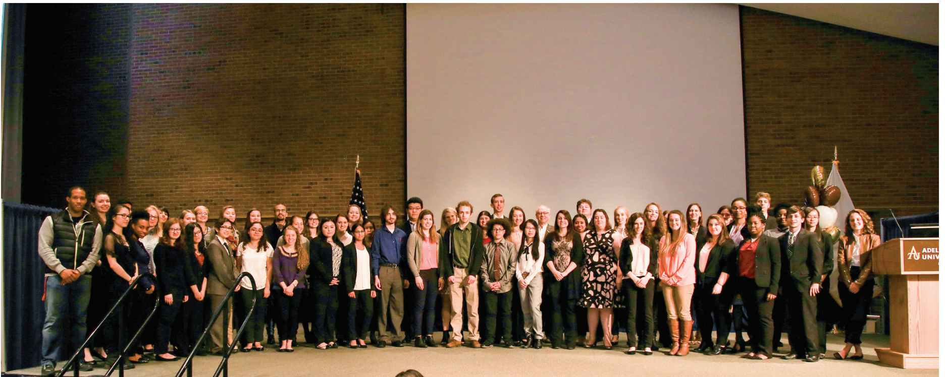
At the end of the Research Conference, all of the award winners and honorable mentions took to the stage to be recognized for their incredible work.